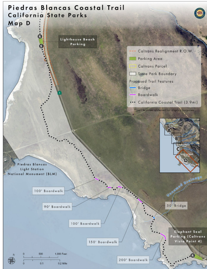
Figure PROJ-6. Piedras Blancas Coastal Trail - Map D

This Map D contains the ~1-mile segment that the County would be permitting if State Parks applies to the County for a CDP.